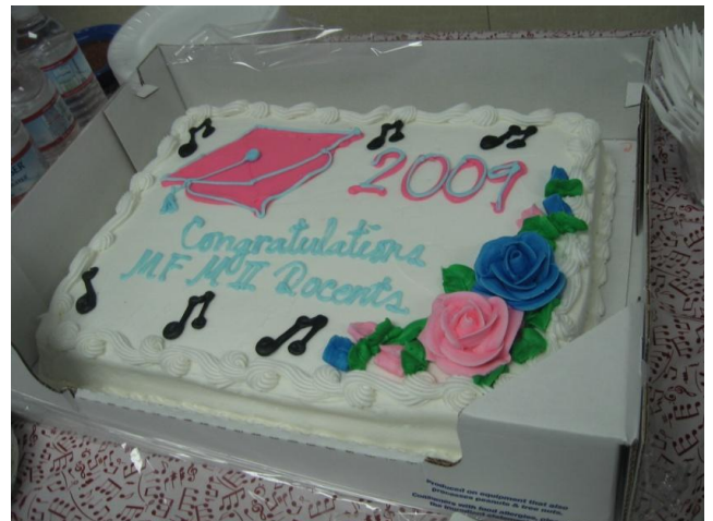
Hip Hip Hooray for another group of wonderful new docents!