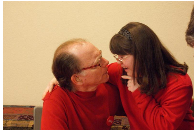
Sharing personal experiences and making lifelong connections.