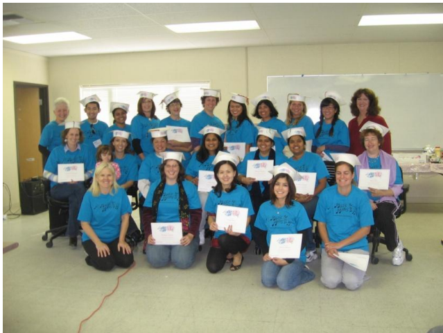
Certified Trainees in the Class of 2009 - Ready for musical fun with children!

We are in need of the CV graduation pictures so that we can highlight them in the next issue. Please forward them to Farnaz, newsletter, fparhami@comcast.net .