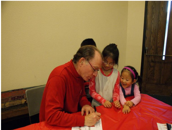
Making more friends while autographing.