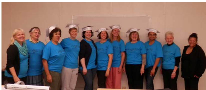
Music for Minors II Castro Valley Graduation Fall 2014