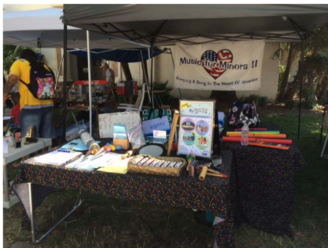
Left: Music For Minors II Displays

them for you. Your school liaison should have shared this information with you already. Suggestions include: Music K8 magazine, Music Express magazine, instruments, multicultural rhythm set, CDs, Charlotte Diamond songbooks/CD, parachute, props. Please let us know your wishes by the end of January , otherwise we will allocate the funds to something else.