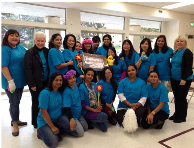
Music for Minors II Fremont – Union City – Newark Graduation Fall 2014