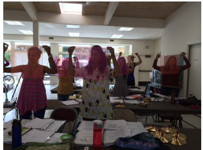
Scarf Dance - Fremont Docent Training Class